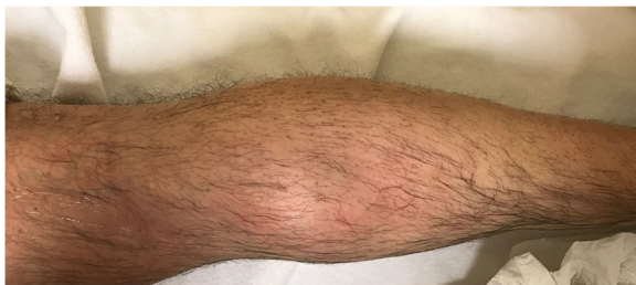
Fig. 1 There was swelling and redness on patient's calf and was similar to deep vein thrombophlebitis

Rheumatoid arthritis is a common, chronic, autoimmune inflammatory joint disease. It appears in 3% of females and 1% of males. Chronic inflammation results in neutrophil infiltration in soft tissues and hypertrophy of capsule, synovial, bursa and tendon sheath. Synovial proliferation is associated with increased joint fluid in these patients [1]. RA damages