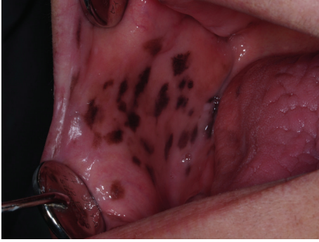
FIGURE 1: Mucocutaneous pigmentation on the buccal mucosa.