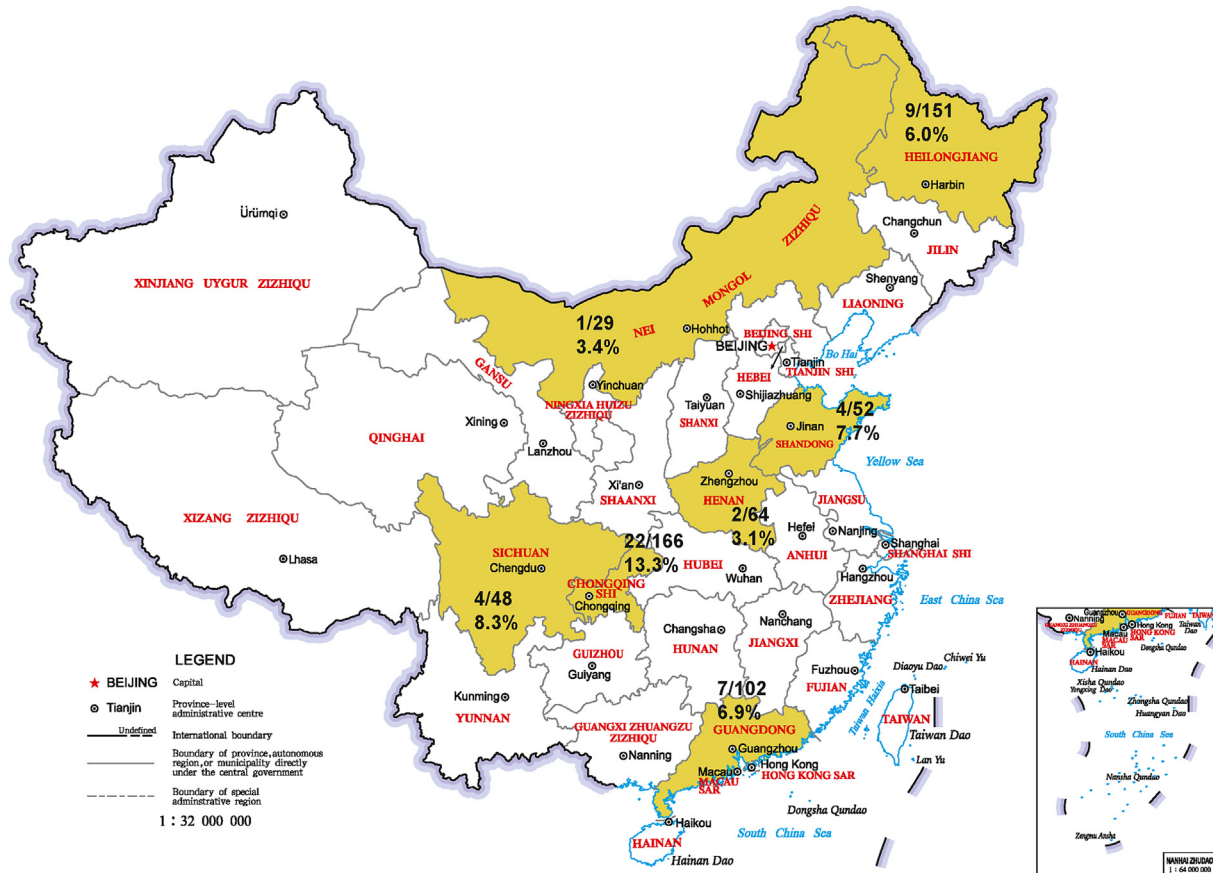
Fig. 1. Locations of sample collection. The sampled provinces and municipality are indicated in yellow. The number of BovHepV-RNA positive samples/total tested samples is demonstrated in each province.

samples from yak was BovHepV-positive, indicating BovHepV infection was firstly determined in this unique cattle species.