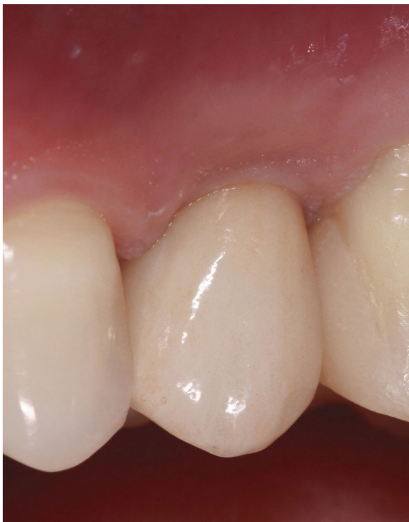
Figure 3. Clinical view of definitive restoration at 12-month follow-up.