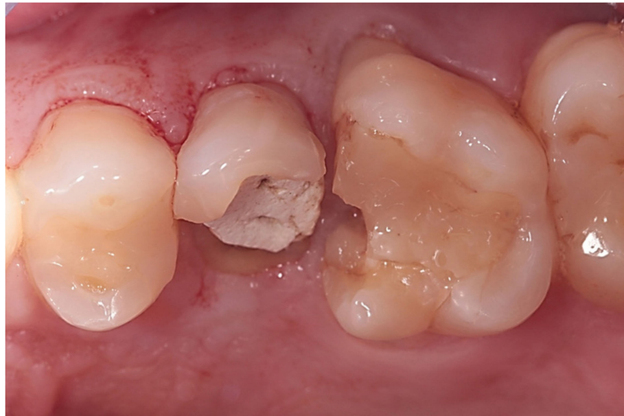
Figure 2. Clinical view of hopeless premolar before extraction.

A periodontal probe (Hu-Friedy PGF-GFS, Hu-Friedy, Chicago, IL, USA) was used to confirm the integrity of the four socket walls. All experimental sites displayed no fenestration or dehiscence, and no regenerative procedures were completed at any of the sites.