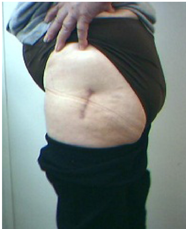
Fig. 1 – Scar of 5.5 cm six months after the operation.

In our study, we noted that the mean age of our patients was lower than seen in studies in the literature, which mostly showed mean ages greater than 60 years. 2,11 This can perhaps be explained by the considerable numbers of cases of osteoarthritis secondary to systemic and rheumatological diseases that were observed in our setting (almost half of our patients). Another possible cause for this finding was perhaps the typical pyramidal age distribution of the Brazilian population, which differs from that of European or North American countries. This lower mean age may represent a source of