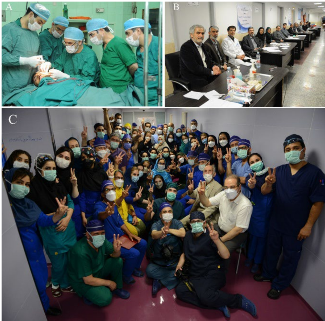
Figure 1: Our medical team. A. At the operating room, 1 st mission (Ramhormoz, November 2009), B. Prepared for initiating medical visit, 11 th mission (Bushehr, January 2014), C. At the operation room, 27 th mission (Tehran, June 2021)

purposes and releasing their photos, as necessary. All medical staff appearing in the photos also provided written informed consent for publication of their photos.