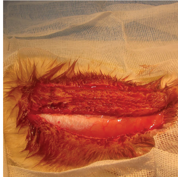
Fig. 1: Caudally based random skin flap in 2x9 cm.

surface of the flaps. Ten days after surgery, the animals were examined by the third examiner and the amount of necrotic segment of the flap was measured with metric ruler in contrast to healthy segment (Figure 2). The results were presented as percentages of skin necrosis area (mean±standard deviation). The difference in the mean percentage of flap necrosis between the two groups was analyzed with statistical package for social sciences (SPSS) software (version 16, Chicago, IL, USA). A p value less than 0.05 was considered statistically significant.