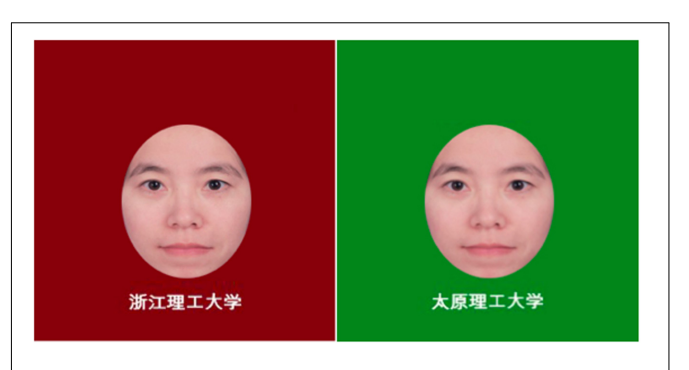
FIGURE 1 | Examples of learning phase stimuli (left: ZSTU; right: TYUT). The authors received signed consent from individuals to have their photos taken and reproduced for the research.

Sixty Chinese hairless full-front faces in color were used as the stimuli (30 female, no stimuli were ZSTU, HZDU, ZJU, TYUT or TSU students, from the face pool of Kang Lee's lab), unfamiliar to the participants, posing with a neutral expression. Adobe Photoshop was used to edit the images to get rid of specific features (i.e., mole) and resize them to approximately 4.5 cm \times 5.5 cm. The sixty faces were assigned into two lists (15 female in each list). One list is used for red background and the other is used for green background. The two lists of the faces were counterbalanced between participants. For no label group, there was no extra information about the faces on the red/green background. For university label group (Figure 1), the university name (ZSTU for red background; HZDU, ZJU, TYUT, and TSU for green background) was inscribed in white Chinese characters (i.e., "浙江理工大学," "杭州电子科技大学," "浙江大学," "太原理工大学," and "清华大学") at the bottom of the background. For the participants in the label group, the faces presented against red background were indicated as in-group and those faces presented against green background were indicated as out-group.