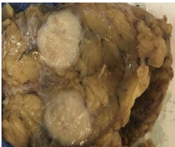
Fig. 2 Gross examination of the surgical specimen. A nodular solid tumor is seen between the upper and lower inner quadrants of the left breast

The conclusion of the pathology report was in favor of spindle cell carcinomatous proliferation. After a multidisciplinary assessment, the patient benefited from a radical mastectomy with axillary node dissection. The gross examination of the surgical specimen showed a nodular solid tumor measuring 30 mm between the upper and lower inner quadrants of the left breast (Fig. 2). The closest surgical margin was the posterior one, at 0.2 cm from the