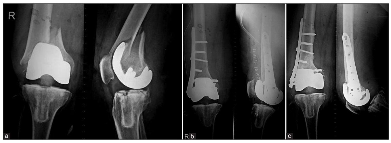
Figure 1: X-ray of knee joint (anteroposterior and lateral views) showing (a) Peri prosthetic supracondylar femur fracture on Rt. side (R 2 type). (b) Treated operatively with DFLP – immediate postoperative X ray. (c) Final followup showing union

The total incidence of the periprosthetic fracture in the operated cases of TKA in our study was 0.58% (23 cases