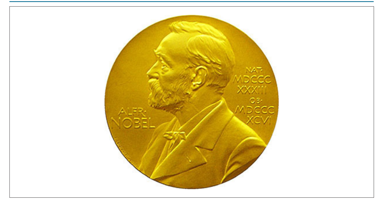
Figure 1 - Nobel Prize Logo.

vessel suture, an important step in the further development of cardiac surgery<sup>1,3</sup>. Only one Brazilian, who lived in England, was awarded. His name is Peter Medawar and he has carried out researches in the immunosuppression area, with future applicability in renal and cardiac transplant<sup>4,5</sup>.