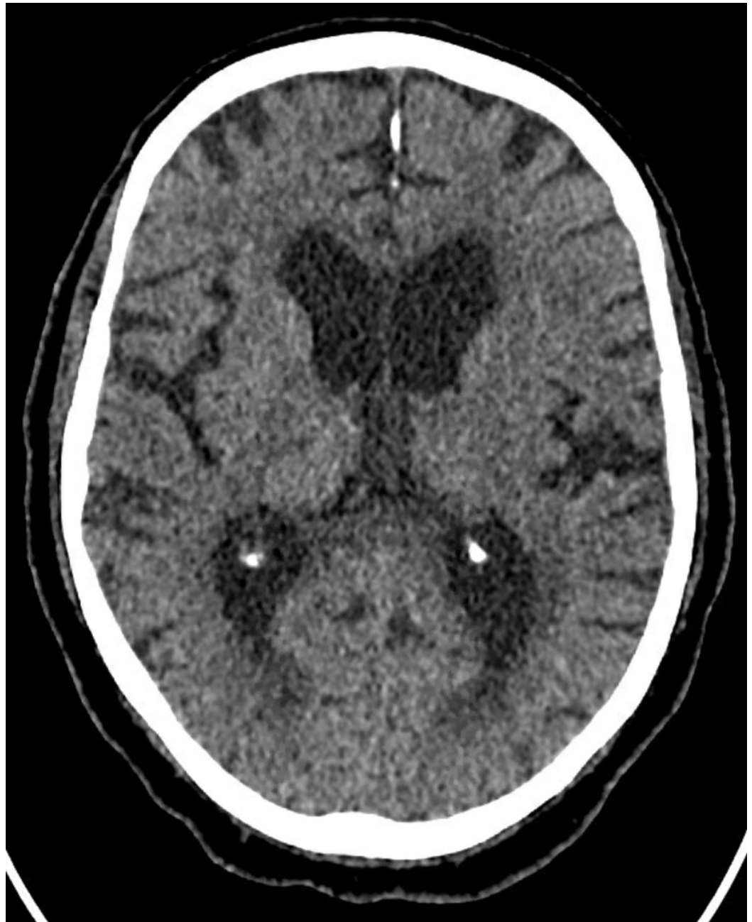
FIGURE 1: CT head without contrast showing no acute intracranial bleed or ischemia