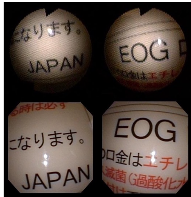
Figure 1 Images from Olympus URF-P5 (fiber-optic) on top, Olympus URF-V (digital) on bottom.

Because digital ureteroscopy utilizes the “chip on the tip” to collect information and relay it to the endoscopy tower, the bulky camera head required for nondigital endoscopic procedures is eliminated (Figure 2). In the author’s experience, the digital ureteroscopes offer improved ergonomics by being lighter and, therefore, easier to handle, something that is especially important during longer procedures where hand fatigue can become an issue. Furthermore, the reduction in scope cords from two (camera and light cord) to one helps to prevent cord entanglement and reduces clutter in the operative field. The combined cord and the elimination