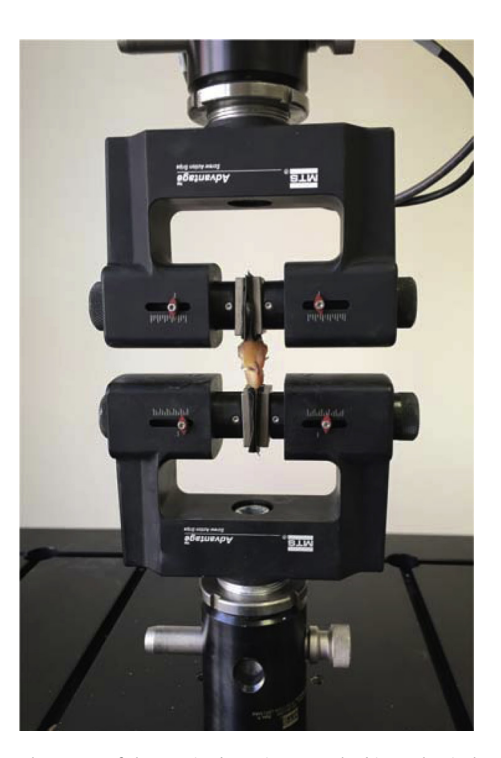
Fig. 2. Placement of the repaired meniscus on the biomechanical tester.

Statistical software was used in the calculations (IBM SPSS Statistics 19, SPSS Inc., An IBM Co., Somers, NY). Values of the variables were given as mean \pm standard deviation. Inter-group