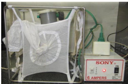
Fig. 2. Mosquito artificial feeding apparatus of based on the idea of Cosgrove et al.