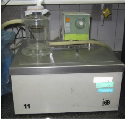
Fig. 1. Tick artificial feeding apparatus

Among the tested membranes, the chicken skin was the best and the heparinized blood had the most efficient because it was not clotted even after 4h. No preference among the tested blood was observed.