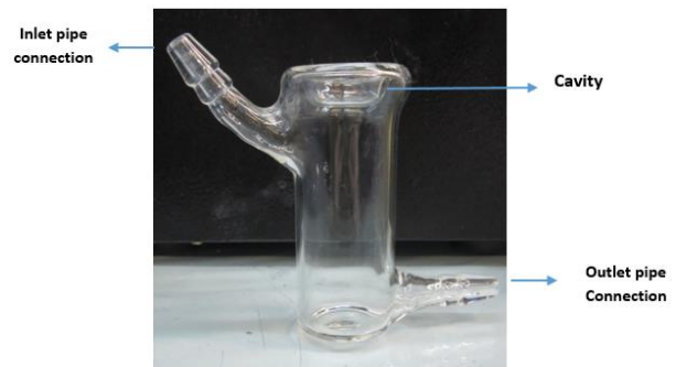
Fig. 4. Glass blood feeder