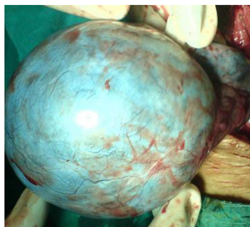
Figure 3 Ovarian cyst showing torsion around its pedicle.

Complications of the cysts associated with pregnancy are torsion of the cyst, rupture, infection, malignancy, impac-