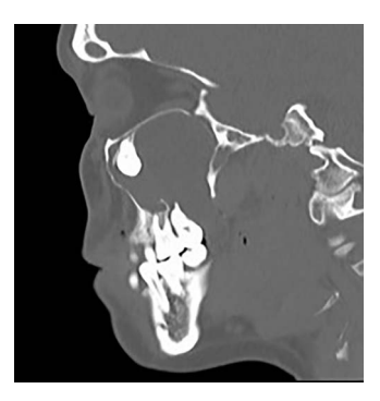
Figure 3. Sagittal CT image of the right ectopic tooth at the antrum of the right maxillary sinus.