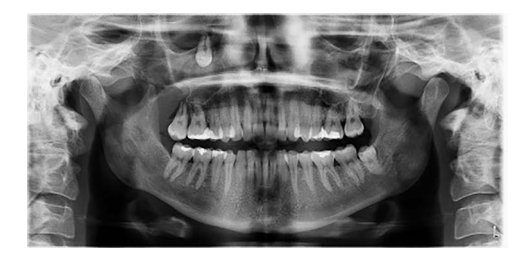
Figure 1. Orthopantomogram depicting the ectopic tooth in the right maxillary sinus.

A 29-year-old female patient was referred from the Maxillofacial surgeons to ENT outpatients, for assessment of a loose upper right molar and right-sided retro-orbital pain, ongoing for 4 months. She had no past medical or surgical history and was a lifelong non-smoker with no significant family history. Imaging with a orthopantomogram (Fig. 1) depicted an ectopic tooth in the right maxillary sinus. CT imaging further characterized a thin-walled cystic mass in the right maxillary sinus (Figs 2 and 3), and opacification of the maxillary and ethmoidal air cells is also visualized alongside the afore mentioned ectopic tooth.