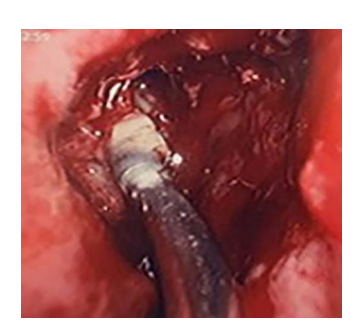
Figure 5. Intra-operative image of the ectopic tooth at the right osteomeatal complex, with curved suction facilitating enucleation.