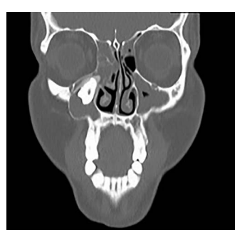
Figure 2. Coronal CT image of the right ectopic tooth at the antrum of the right maxillary sinus.

Flexible nasendoscopy offered little in terms of diagnostic benefit. An exam under anesthetic with a view to removing the ectopic tooth via endoscopic sinus surgery was warranted. Right middle turbinate trimming along with a right maxillary antrostomy was performed. The tooth was immediately identified at the antrum as depicted in Figs 4–6. The bony capsule of the tooth was entered and, on manipulation, a second ectopic tooth was identified (Fig. 7) both of which were removed en bloc. The cystic component within the maxillary sinus was marsupilized and extracted. The sinus cavity can be