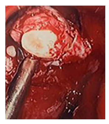
Figure 6. Intra-operative image of the ectopic tooth at the right osteomeatal complex, with curved suction facilitating enucleation.

viewed with the utilization of 70° endoscope (Fig. 8). This facilitated bipolar cautery of the base of the cyst and confirmed the absence of an oroantral fistula.