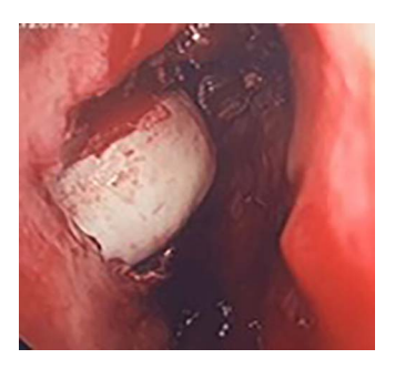
Figure 4. Intra-operative image of the ectopic tooth at the right osteomeatal complex.