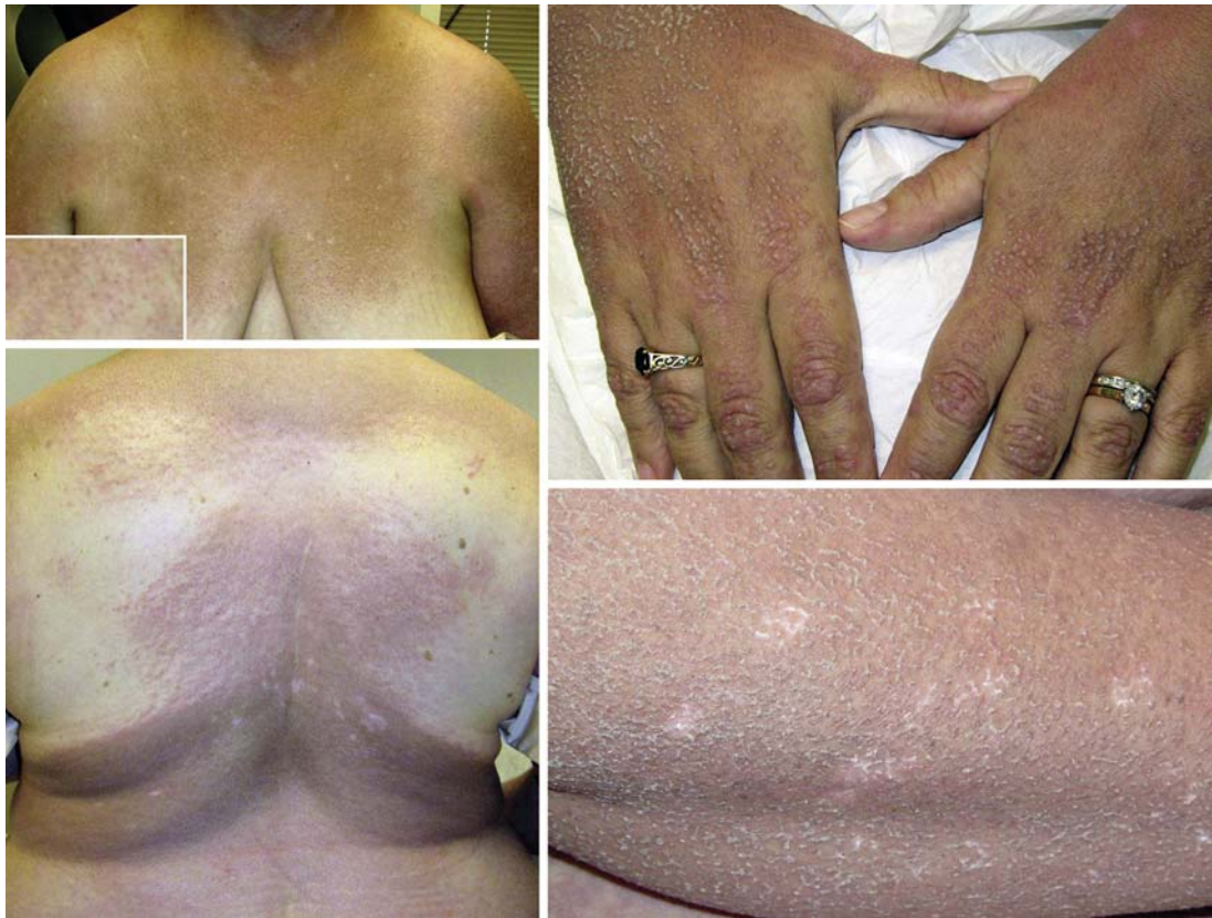
Fig. 1. Clinical presentation of Wong-type DM with porokeratosis-like changes. The top left panel shows a diffuse hyperpigmented plaque and keratotic follicular papules ( inset ). The bottom left panel highlights confluent patches and plaques of coarse, dirty grayish, hyperkeratotic skin with areas of dull-pink discoloration as well as islands of sparing. The top right panel demonstrates Gottron's papules over the phalangeal-metacarpal and interphalangeal joints as well as numerous markedly keratotic papules over the dorsal hands and forearms. The bottom right panel shows, within the regions of generalized hyperkeratosis, scattered hypopigmented lesions with a collarette of fine scale reminiscent of porokeratosis.

numerous melanophages and free melanin found at the dermal-epidermal junction and papillary dermis. In addition, extensive dermal mucin deposition was evident. In addition, irregular psoriasiform hyperplasia, alternating mounds of para- and orthokeratosis, and follicular plugging were superimposed on the interface alterations. No basement membrane thickening or dermal infiltrates of neutrophils and/or eosinophils were identified (fig. 2). Biopsy of the papules with fine collarettes of scale showed discontinuous vertical tiers of dyskeratotic cells admixed with parakeratotic cells associated with underlying focal hypogranulosis, vacuolar interface alterations and degenerated keratinocytes. This constellation of histopathologic findings resembles those described for columnar dyskeratosis (fig. 3) [16]. Direct immunofluorescence studies demonstrated C3 superficial vascular deposits, trace basement membrane IgM deposits, and numerous colloid bodies – changes that can be found in DM [15].