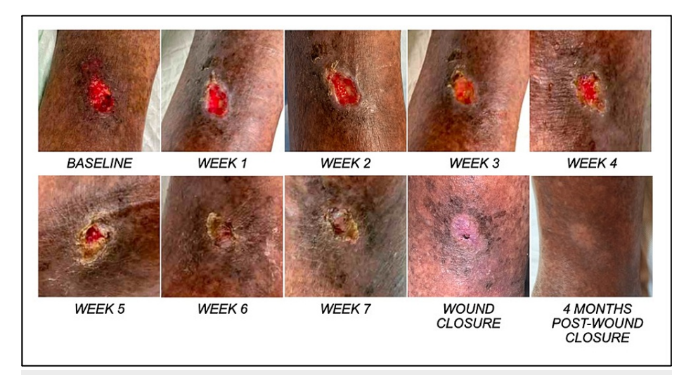
FIGURE 2: Patient 1 wound healing progression with weekly blue light therapy on left shin wound.