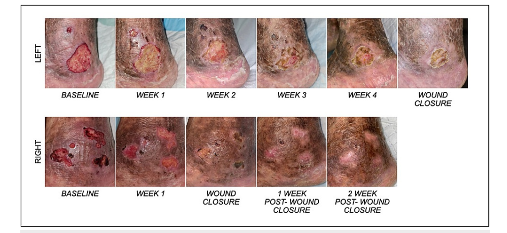
FIGURE 3: Patient 2 wound healing progression with weekly blue light therapy on left lateral malleolus (top), and right medial malleolus (bottom) wound.

background of chronic venous insufficiency. He has a past medical history of hypertension with cardiac right bundle branch block, and vitamin B12 deficiency. The onset of the non-healing venous ulcers dated back to early 2017. Prior to the blue light therapy, the patient was on a four-layer compression dressing and underwent iliac venoplasty and stenting in 2019. The recurrent ulcers remained healed for a year before recurring in 2021. Prior to blue light therapy, his ulcers had already recurred for three weeks. Adjunct with the patient's weekly dressing change, blue light therapy was administered for 120 seconds on both the left lateral malleolus wound and the right medial malleolus wound, until wound closure. Each dose of blue light therapy was administered at a height of 4cm from the wound, with an irradiated area of 20 cm<sup>2</sup>. Regions of the ulcer that fell outside of the irradiated area, were administered to in subsequent rounds. The baseline wound size of the right medial malleolus and left lateral malleolus were 13.5 cm<sup>2</sup> and 10.5 cm<sup>2</sup>, respectively (Figure 3). By week 3, the right medial malleolus wound had healed, while the left lateral malleolus had a size reduction of 37.8% (week 4; 6.25 cm<sup>2</sup>). Complete closure of the left malleolus wound was noted 6 weeks after the use of blue light therapy.