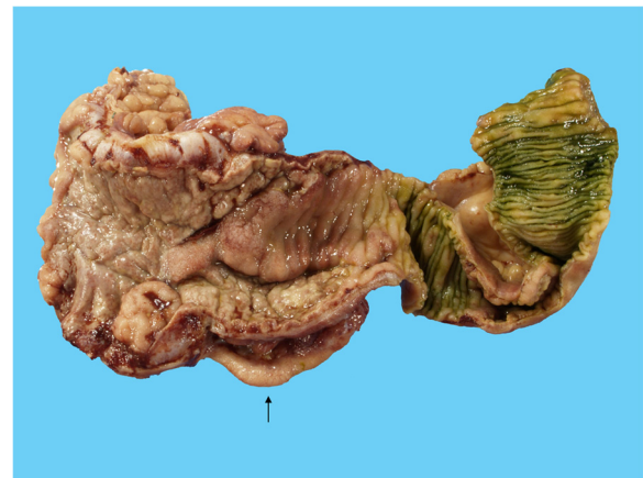
Figure 1 Gross pathologic findings of the terminal ileum, the ileo-cecal valve and the cecum (from right to left). The terminal ileum shows acute ulcers with elevated ulcer rim and irregular base. The mucosa of the ileo-cecal valve and the cecum shows a confluent ulcer with an elevated border. The submucosa is markedly edematous. The vermiform appendix (†) is mildly congested.

In February 2010, there was another episode of massive hematochezia, resulting in a partial right half colectomy. Multiple scattered ulcerative lesions involving the terminal ileum, the cecum and the ascending colon were found on gross examination (Figure 1). The histo-pathologic findings were acute mucosal ulcers with granulation tissue and tissue eosinophilia. The submucosa was thickened and edematous. The acute and chronic inflammatory cells