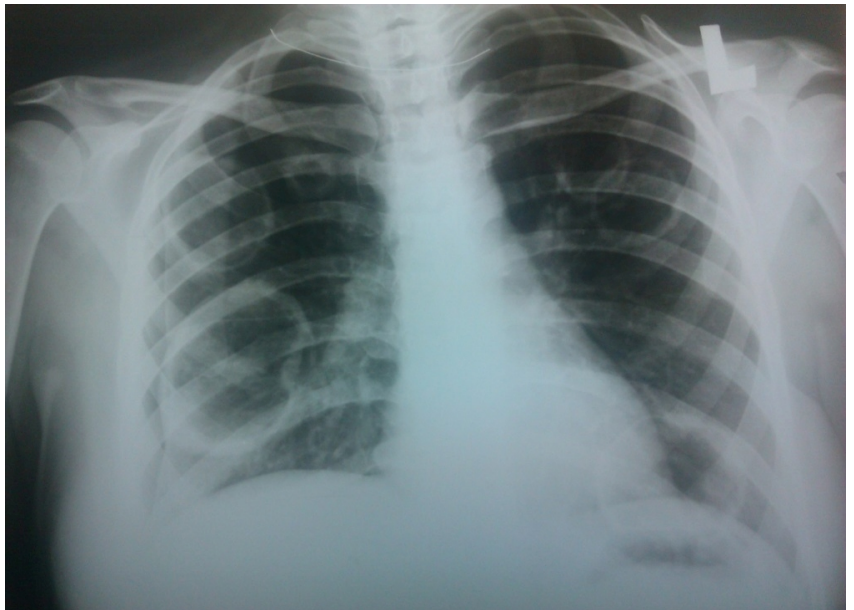
Figure 1. Chest x-ray showing three cavities in right lobe and three cavities in left lobe in lower and upper zone

to antibiotic treatment (intravenous ceftriaxone). The patient's past medical history showed joint pain (arthralgia) in the knees, proximal interphalangeal joints (PIP), malar rash, oral ulcers, and leukopenia. SLE was diagnosed.