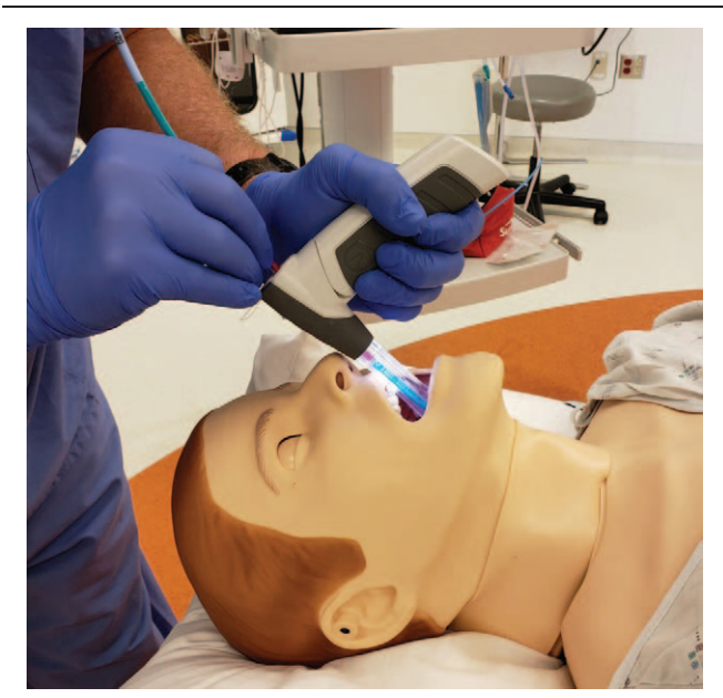
Figure 1. Vie Scope laryngoscope

Once intubation was achieved, an anesthesia bag (producer) was connected with the endotracheal tube and a breath was given.