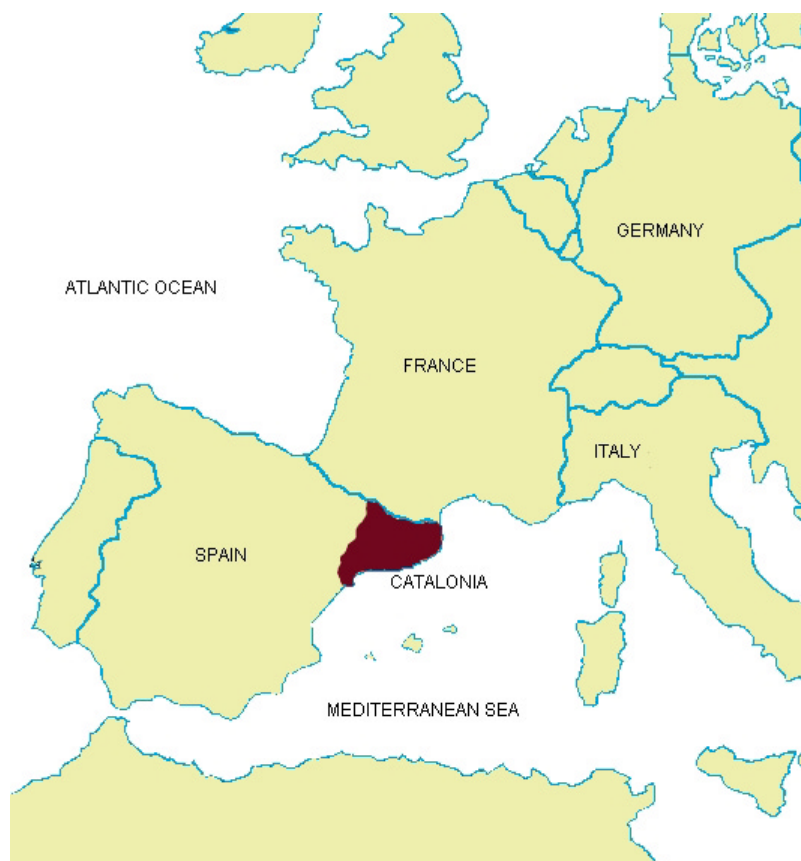
FIGURE 1. Geographical location of Catalonia in Europe.

industrial sector, which accounts for more than 22% of the gross value of Spanish agro-industry. The livestock sector, which is characterized by the specialization in livestock fattening, has undergone very strong development and today represents some 60.5% of all agricultural output.