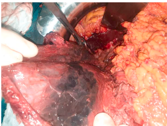
Fig. 3. Per operative image showing total gastric necrosis.