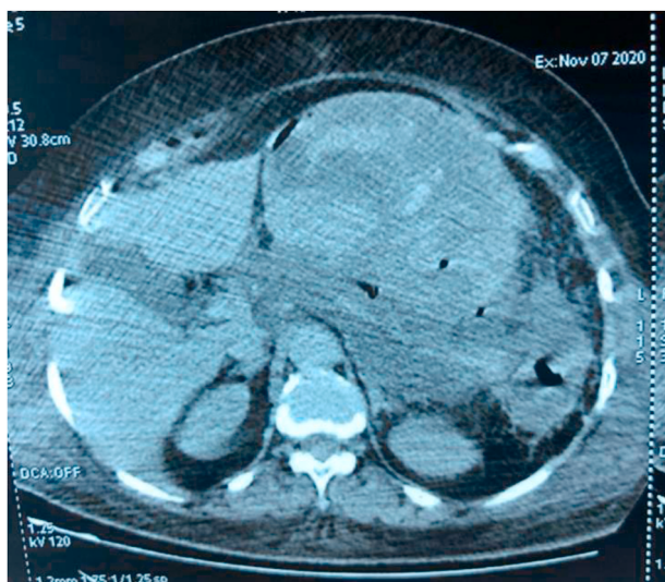
Fig. 2. CT appearance of stage E pancreatitis according to the Balthazar classification with peripancreatic necrotic collections.