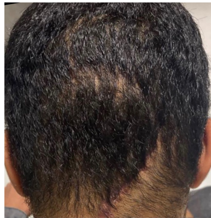
Fig. 2. Post-operative photograph taken from well healed wound of a patient. No sign of wound complication is visible.

Suboccipital craniotomy through a midline skin incision has been the most extensively accepted surgical approach for achieving pathologies in the posterior fossa and CVJ [3, 4, 7]. Using this approach, the surgeon and the patient might experience difficulties, which we attempted to solve with our novel technique. In this technique, a question mark-shaped incision is performed rather than a midline incision in an avascular plan, which primarily makes a well-vascularized musculocutaneous flap supplied by the occipital artery. Therefore, it improves the wound-healing process by enhancing the blood supply. Moreover, the incision begins at the level of the C1 vertebra and is not extended to the C2 vertebra, where the origins of suboccipital muscles such as rectus capitis posterior major and obliquus capitis inferior are located [15]. As a result, these muscles remain virtually intact, reducing the risk of damage and maintaining neck stability. In this new incision, the pathway of the muscular incision provides a wide area for craniotomy with adequate