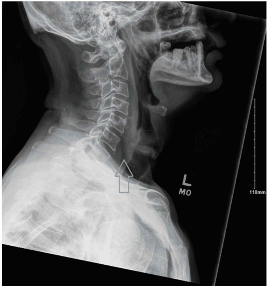
FIGURE 2: X-ray soft tissue neck revealing mild prevertebral soft tissue swelling at the level of C6 (grey arrow).

The patient was initially started on empiric therapy for retropharyngeal abscess, including IV ceftriaxone, vancomycin, metronidazole, and dexamethasone. Surgical drainage was avoided due to the lack of adequate access to the retropharyngeal space and rapid clinical improvement. Two days later, he was extubated and transferred out of the MICU. His antibiotic regimen was de-escalated to IV cefepime and metronidazole after confirmation of S. paucimobilis . The patient gradually improved with repeat soft tissue neck CT, demonstrating a significant decrease in airway swelling and abscess resolution. He continued to improve on the antibiotic regimen. Repeat blood cultures did not yield any bacterial growth. The patient was hospitalized for eight days and discharged with a peripherally inserted central catheter (PICC) to complete 21 days of antibiotics. He was discharged with no apparent medical sequelae.