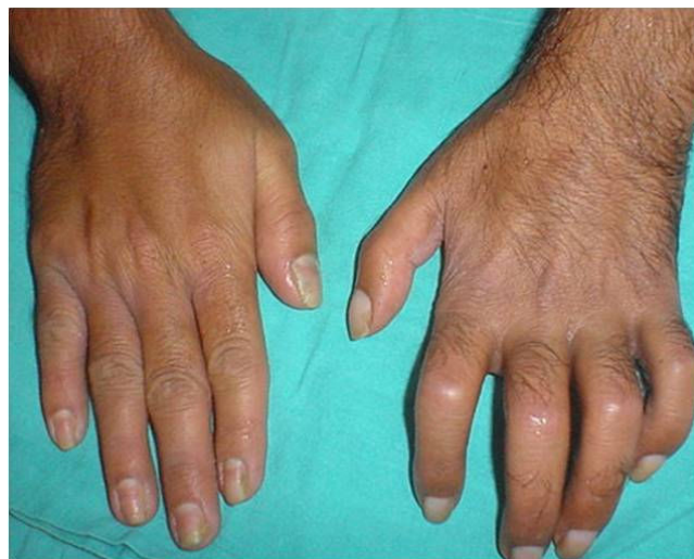
Figure 1 Typical features of CRPS. Note the hypertrichosis, edema, joint stiffness nail changes, skin atrophy, mirror image changes in opposite hand.

adjuvant were tried unsuccessfully. In the 10 th week, a trial of SGB with 10 mg Ketamine as an adjuvant was given after informed consent and midazolam premedication. He experienced 'light headedness', described as a pleasant floating sensation and reported dynamic VAS score to be 1. The pain relief lasted for 36 hrs. Thereafter, he received 3 days of continuous stellate ganglion infusion [0.0625% Bupivacaine with 0.5 mg Ketamine/day] @ 2 ml/hr. The improvement was rapid, VAS [static] remained 0, dynamic VAS [1,2], with reduction in the intensity of heat and mechanical allodynia [1–2/10]. Weight bearing physio-