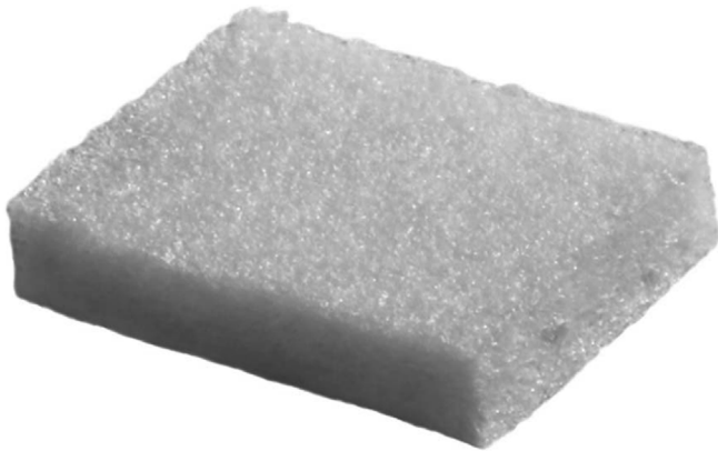
Fig. 3. Ologen implant.

pore size of 10–300 \mu\text{m} (Fig. 3). Some advantages of the ologen implant is that it has a low immunogenicity profile because it is free of telopeptides, it does not need to be harvested from human donors, and it has improved cosmesis compared to other materials. 21,22 It avoids direct contact between the conjunctiva and the tube and acts as a wound-healing scaffold. More recently, Stephens et al. 23 demonstrated that the ologen implants might be successfully used as a primary patch graft in GDD surgery. In 43 eyes, only two developed tube erosion at 4 months and 26 months respectively, which is believed to be due to inappropriate coverage of the graft material during the surgery.