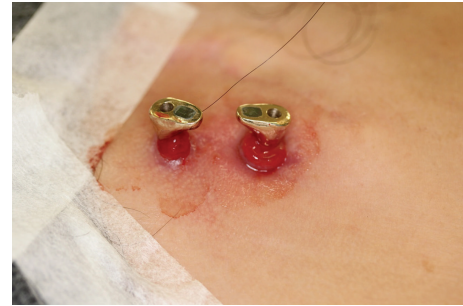
FIGURE 3: Persistent adverse periabutment skin response around the gold alloy abutments.

Discoloration was also noted in 2 out of 3 patients who were willing to wear the prosthesis. In one patient the