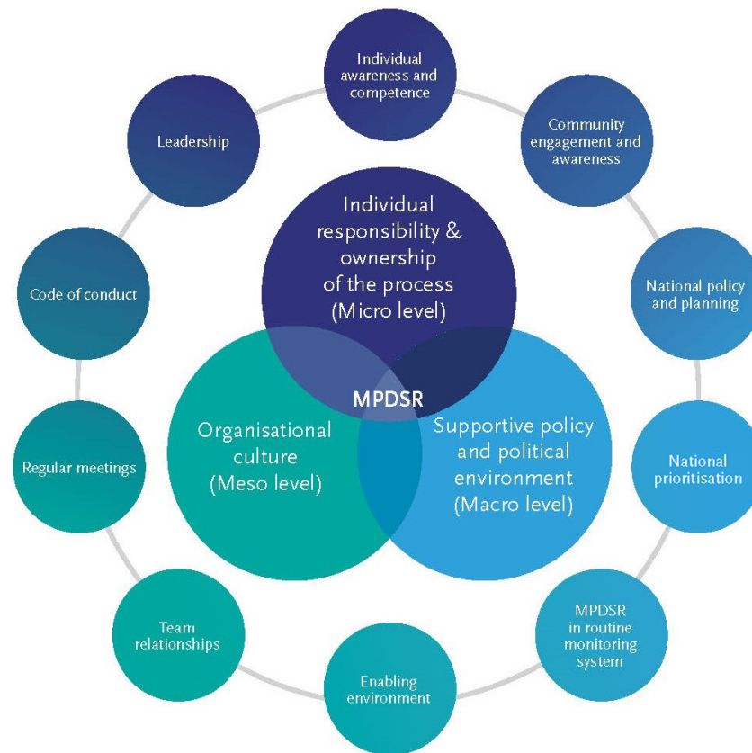
Figure 1. Framework for overcoming blame culture to promote a positive implementation culture for MPDSR.