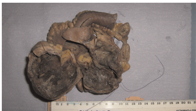
Figure 1. Resected specimen showing Giant Meckel's diverticulum.