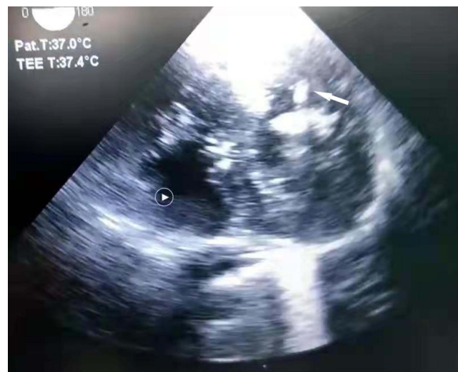
Figure 1 A medium echoic mass revealed by echocardiography.

Note: The white arrow shows large polypoid vegetations in the posterior leaflet of the mitral valve due to Corynebacterium infection.