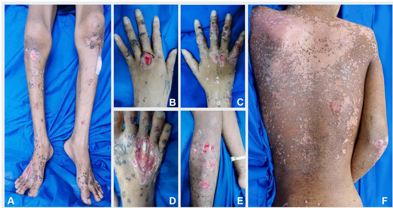
Figure 1 Skin disorder in forms of multiple bullous and ulcers on both of the legs (A and E), hands (B and C), and feet (D). On the back, there were erythematous macules and scale lesions (F).

The patient was hospitalized for two weeks and treated with a systemic antibiotic for one week. Another systemic treatment was prescribed by the Internal Medicine Department, including methotrexate 7.5 mg/week, methylprednisolone