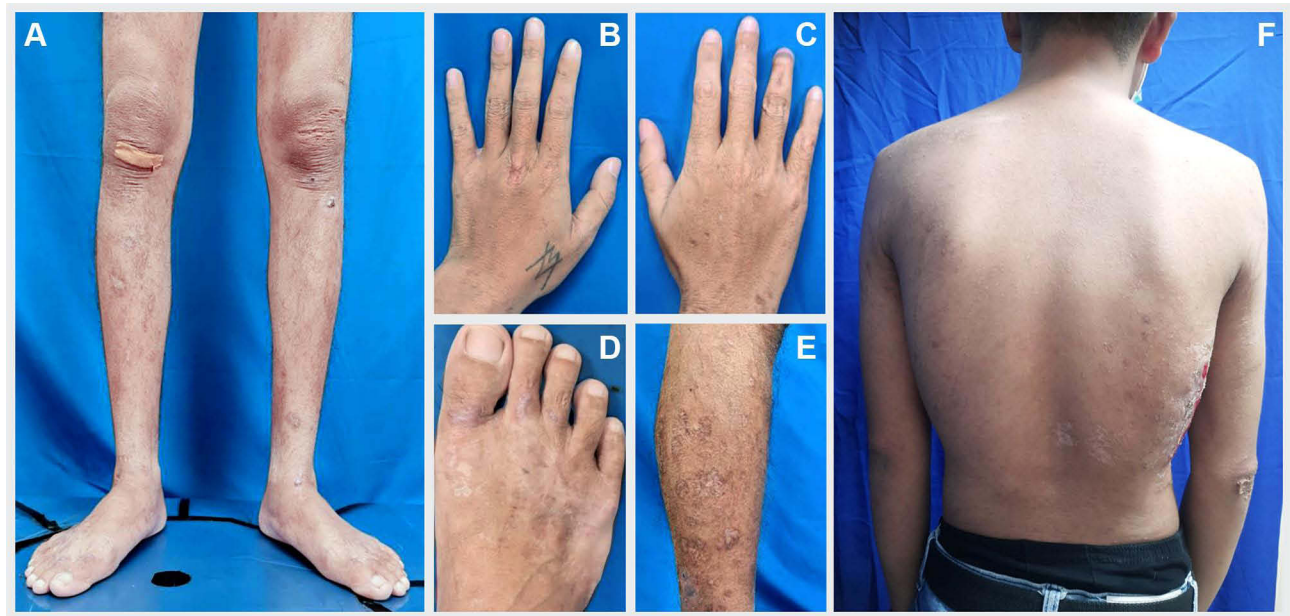
Figure 3 After 6-month of treatment, multiple bullous and ulcers in both legs (A and E), hands (B and C), and feet (D) disappeared. Some of the macule and scale lesions at back also disappeared (F).

40 mg/day which was then tapered off, folic acid 1 mg/day, and calcium carbonate 500 mg twice a day. We provided modern wound dressing for skin ulcers using dialkyl carbamoyl chloride, hydrocolloid, and hydrogel dressings. His skin lesions showed improvement after four weeks of therapy. The patient was in complete remission state after six months of treatment (Figure 3A–F), followed by a relapse episode that manifested as new skin ulcers and hematuria one year later.