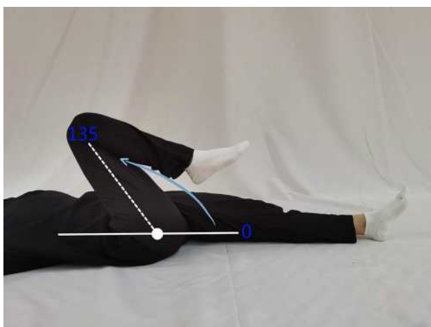
Figure 3 Hip flexion test chart.

and brings them close to the chest. We fix the goniometer axis at the femur's greater trochanter; the fixed arm was parallel to the ground; we place the movable arm along the middle of the femur. The Patient exerts the maximal effort of actively flex the hip and record the movement angle of hip flexion (0–135°, Figure 3).