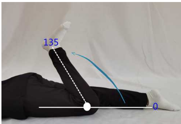
Figure 1 Knee joint flexion test chart.