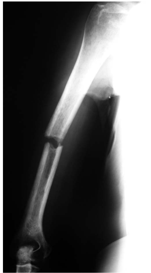
Figure 2 Lateral view of the right humerus.

were placed proximally in the mid-shaft of the humerus. Acute shortening of 1.0 cm via the Ilizarov fixator with immediate bone-to-bone contact at the nonunion site was then performed. The procedure was accomplished under fluoroscopic guidance. The radial nerve was explored in order to avoid nerve injury during wire insertion. Autologous cortico-cancellous bone graft harvested from the contralateral ilium was applied to the nonunion. The total operating time was 120 minutes.