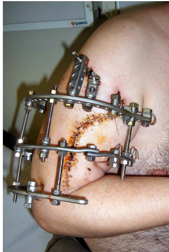
Figure 6 Photograph of the same Ilizarov circular frame. Note the proximal and distal 5/8 rings that facilitate active shoulder and elbow range of motion.

The incidence of nonunion of humeral shaft fractures after both conservative and surgical management is reported to be as high as 1-15% [2-7]. Failure to unite after surgical management of diaphyseal fractures of the humerus could be multifactorial. Factors that may play a role in nonunion include inadequate fracture fixation, osteopenia/osteoporosis, infection, devitalization of bone, and poor contact between the fracture segments. Most nonunions of the humerus are associated with angulation, displacement, over-riding, limb shortening, and osteopenia. Treatment options include internal fixation supplemented with cancellous bone graft, intramedullary nailing, free vascularized fibular graft, and Ilizarov circular frame fixation. Locking plates and dual