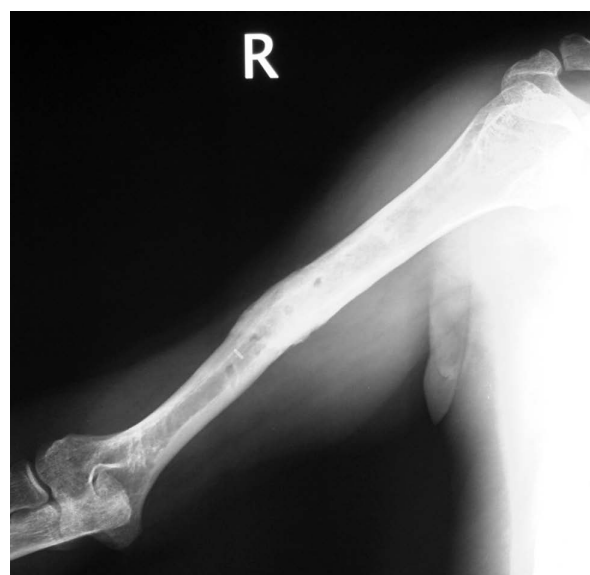
Figure 8 Lateral view of the humeral fracture 4 years postoperatively.

If intramedullary nailing is selected for the management of diaphyseal fractures of the humerus, nonunion is reported in a higher rate than plating, ranging from 0 to 33% [23,24]. Exchange nailing in cases of nonunion of the diaphysis femur or tibia is a viable method for achieving union. However, humeral shaft fractures complicated by nonunion cannot achieve union after reaming and exchange nailing [24]. This can easily be explained biomechanically by the absence of axial loading in the humerus and the presence of greater torsional and distractive forces than in tibia or femur [25]. Further drawbacks following intramedullary nailing include shoulder or elbow stiffness, depending on the point of insertion, radial nerve palsy, disruption of the endosteal blood supply, and fracture instability if the nail remains unlocked [26]. According to some authors,