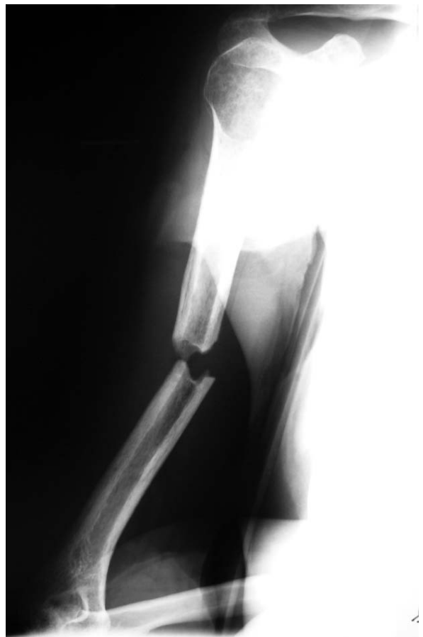
Figure 1 Anteroposterior radiograph of the right humerus of a 43-year-old man sustained a transverse diaphyseal fracture after a fall during a generalized tonic-clonic attack.