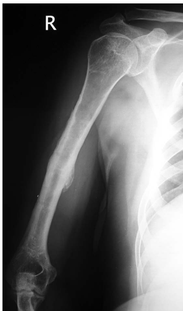
Figure 7 Anteroposterior radiograph of the humeral fracture 4 years after surgery. Union was achieved 4.5 months after initial application of the frame.