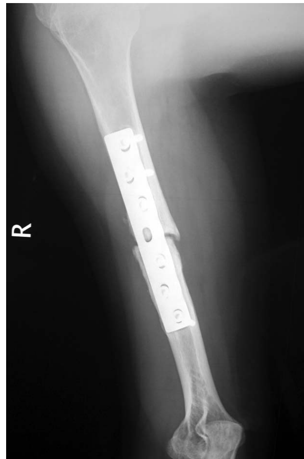
Figure 4 Lateral view of the right humerus 18 months postoperatively.

compared with that expected in nonepileptic population [9]. In a comparative study of 202 institutionalized patients with epilepsy the frequency of fractures of the humerus was increased fourfold compared with a normal population [10]. The relative risk for humeral fractures is most increased in patients more than 45 years of age [11]. Seizure activity may cause fractures, usually vertebral compression fractures, as a result of spine hyperflexion during extreme muscular contractions [12]. Bilateral posterior fracture dislocation of the shoulder is highly indicative of seizure [13]. Trauma or fall during tonic-clonic, tonic, or atonic attack is also associated with fracture of the humerus along with fracture of the hip, ankle, and wrist [10,11]. Repetitive, uncontrolled seizure activity, especially tonic-clonic attacks, as in our case, may also adversely affect the process of fracture healing, making the management of such fractures a challenging surgical problem.