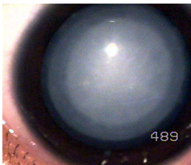
Figure 2. Slit lamp photograph of affected lens. A slit lamp photograph is shown of the affected lens (left eye) in the three-year-old proband (III:2, Figure 1). Cataract is of the opalescent type. The central nuclear region is more dense than the periphery.

Mutation analysis: The candidate genes, CRYAB (NM_001885) and CRYGS (NM_017541), which were localized at 11q23–24 and 3q26.3-qter, were analyzed by bidirectional sequence analysis. The primers were designed to amplify the coding regions and 30–50 bp flanking intronic regions using the PrimerSelect program of the Lasergene package (DNA STAR Inc., Madison, WI). Amplification and sequencing were performed as described elsewhere [4]. The