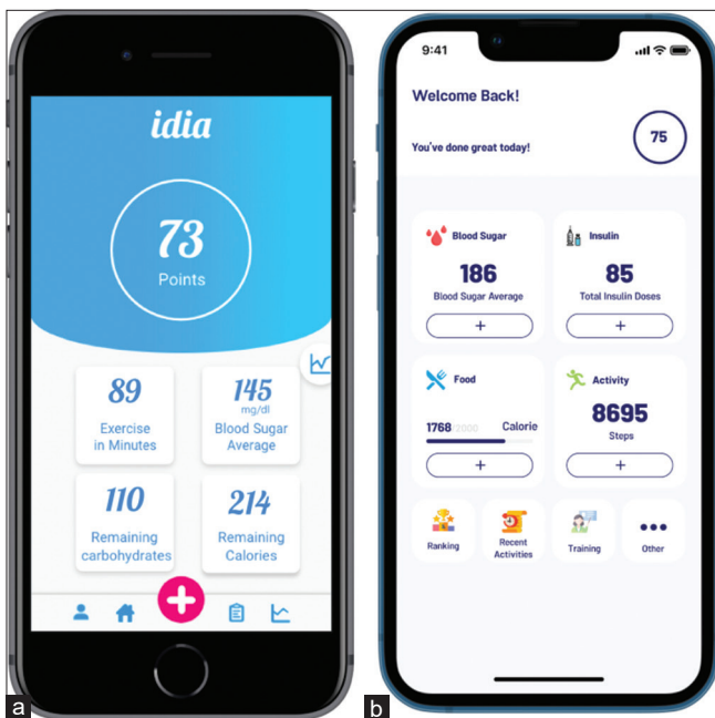
Figure 2: The clinical information and the level of user activity in the initial (a) and upgraded (b) versions of the Diabetter application

recommendation algorithms within the application led to a higher engagement among active users, who frequently logged their blood glucose data. This resulted in a greater proportion of recorded blood glucose levels falling within the normal range.