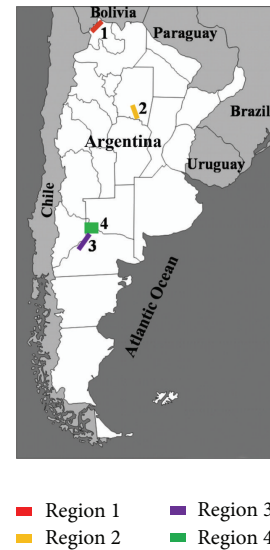
FIGURE 1: Map of the four regions included in this study.

The present study was conducted in order to investigate if nutrition, work activity, and eye protection from solar radiation are involved in the development of CDK. We carried out this research by studying individuals who inhabit a region of Argentinean Patagonia where we have found patients with this corneal disease (El Cuy department in the Argentinean Patagonia) and in other three Argentinean