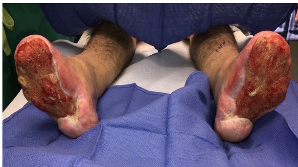
Figure 4 Both feet 3 months after transmetatarsal amputations and application of Versaflow wound VAC.