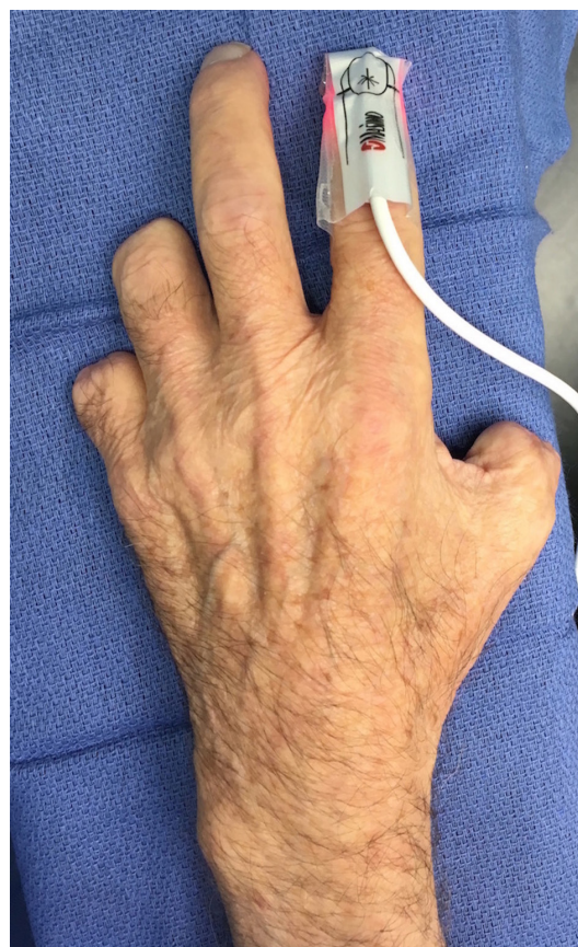
Figure 1 The left hand after amputation of digits 1, 4 and 5.

The following day the patient's blood pressure began to improve, all vasopressors were tapered, and IVF was continued. The patient was continued on broad-spectrum antibiotics, although all cultures have been negative since admission. Two