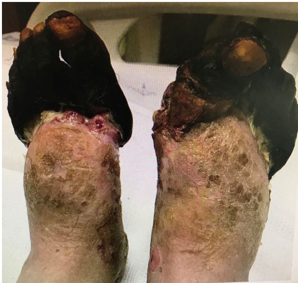
Figure 2 Demarcated gangrene on the dorsal aspect of both feet.

days after vasopressor administration, a bluish discoloration was noted on the patient's upper and lower extremities, capillary refill was more than 3 s, radial and dorsalis pedis pulses were dopplerable, and the skin was intact and cool to touch. Dopamine was discontinued 2 days after administration. Three days later the patient developed gangrenous changes to his left hand and bilateral feet and was given intravenous argatroban 1.5 µg /kg/min. The patient was also dialysed throughout his stay to correct his acidosis. On day 9 since admission, the