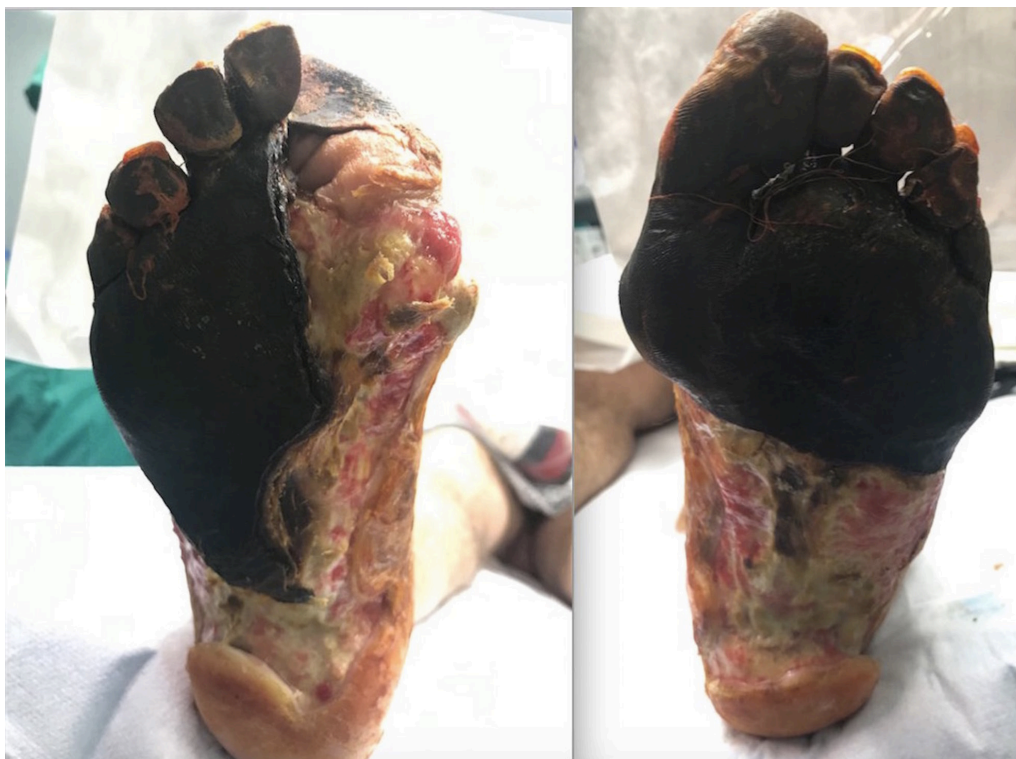
Figure 3 Demarcated gangrene on the plantar aspect of both feet.

The patient is currently continuing his recovery as an outpatient with the goal of full ambulation over the next several months.