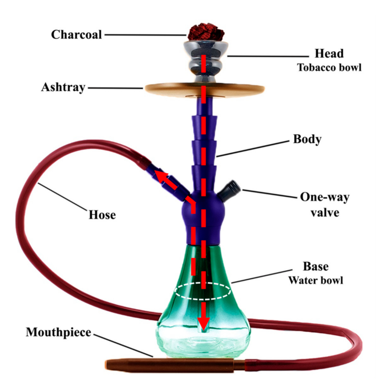
Figure 1. Different parts of one of the most common types of waterpipe smoking device.