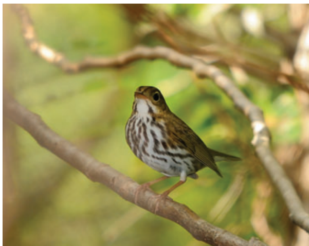
Figure 1. The Ovenbird breeds throughout much of eastern North America and winters in the Caribbean and Central America (photo taken in the Guánica Dry Forest by Mike Morel).

et al. 2009). However, it is important to continue developing new markers because in many species a clear picture of connectivity emerges only when multiple techniques are used (Boulet et al. 2006; Norris et al. 2006).