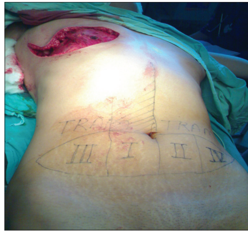
Figure 2: Post-mastectomy defect in a patient with breast cancer