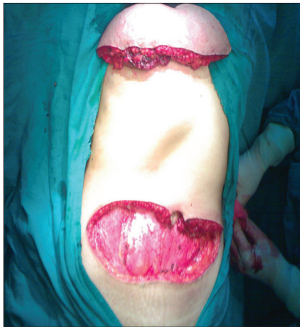
Figure 3: TRAM flap being transposed to the mastectomy defect