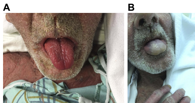
Figure 3 (A) Normal appearance of the patient's tongue. (B) Raynaud's phenomena of the tongue with central whitening of the lingua after drinking cold water.