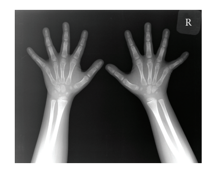
FIGURE 2: The patient's bone age was only 4.5-5 years according to the Greulich and Pyle atlas.

Severe iron deficiency anemia without thalassemia was noted (hemoglobin: 8.8 g/dL, RBC: 4.18 million/ul, MCV: