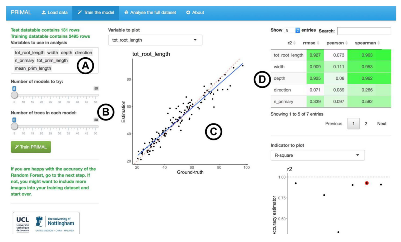
Figure 3: Screenshot of PRIMAL. (A) Variable to evaluate with the Random Forest algorithm. (B) Random Forest algorithm parameters. (C) Visualization of the accuracy of the Random Forest estimators. (D) Accuracy metrics for the different descriptors.

Green is a correct identification compared to results obtained using the RootNav pipeline, pink is a miss, yellow is a false positive, and grey is not comparable. Numbers represent the significant LOD score for each detected QTL generated by R/qtl [19]. Chr: chromosome; EST-100:900: Random Forest estimators derived from 100–900 images; GT: ground-truth, ID: image descriptors derived from RIA-J.