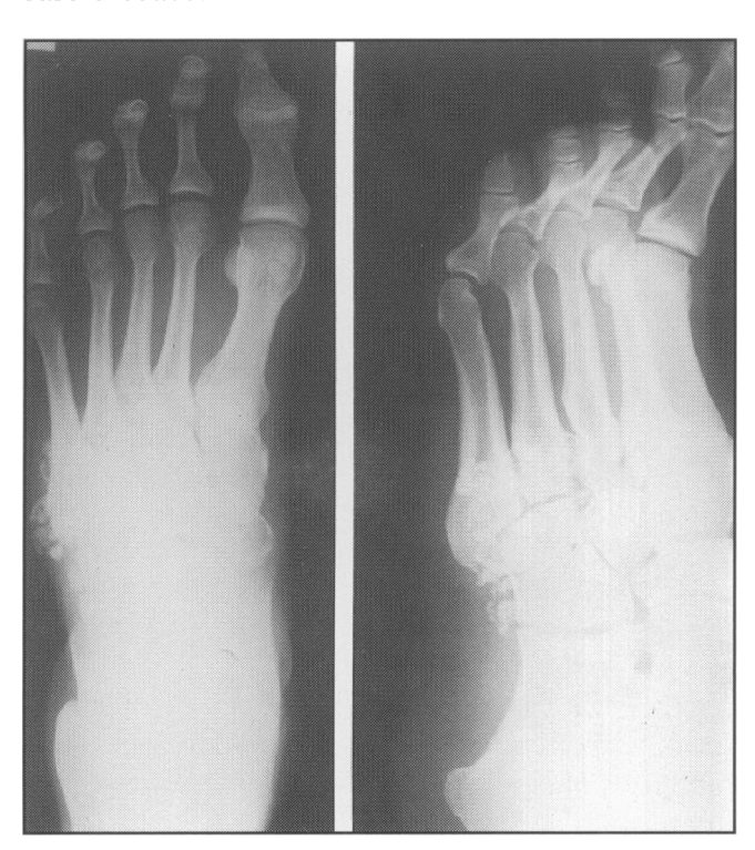
Fig. 1 PA and oblique views of the foot.

We present a case of cubometatarsal joint synovial chondromatosis, which is an unusual site for this rare disease.