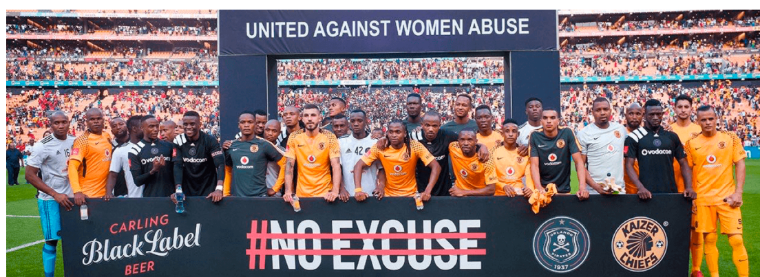
Figure 3. #NoExcuse campaign by Carling Black Label, South Africa [80].

Both industries are increasingly focusing their CSR activities on female ‘empowerment’ in low- and middle-income countries, where women represent a growing market [32]. Philip Morris International (another cigarette giant) sponsors women’s empowerment programmes in China and self-help groups in Argentina [72]. Spirits producer Diageo partnered with an international charity to support programmes combating gender-based violence [73,74] and a petition to ban violence and harassment in the workplace [75]. AB InBev—the world’s largest beer company—took a high-profile role in South Africa’s #NoExcuse campaign against gender-based violence [76] with their Carling Black Label beer featuring prominently in campaign materials [77] (Figure 3). Initiatives such as these serve to create a ‘responsible’ public profile for alcohol companies while simultaneously promoting their reputation and brands [78] and distracting from the role of alcohol in violence against women [79].