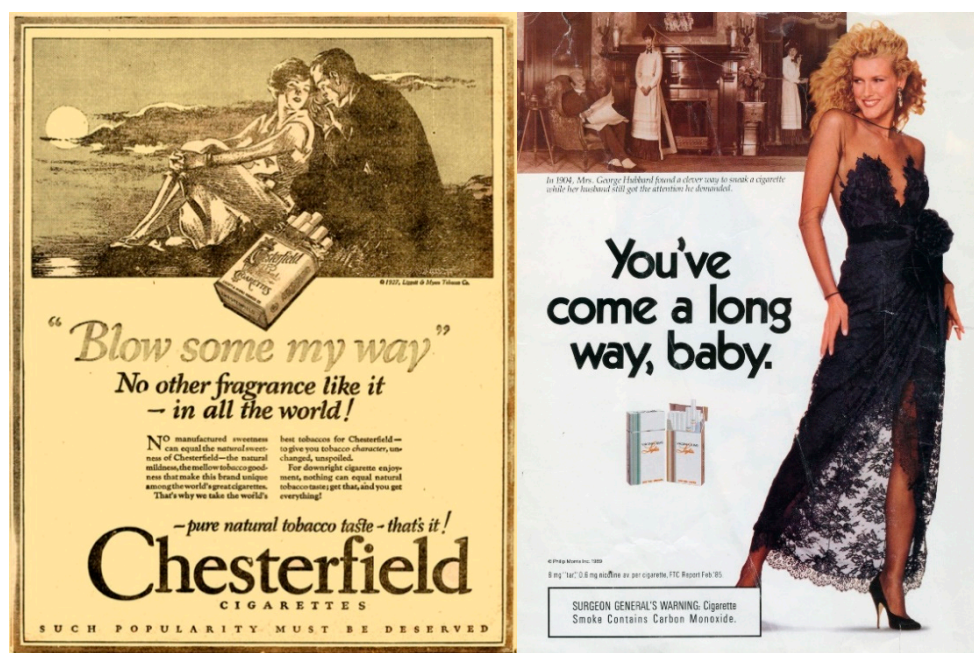
Figure 1. Women and cigarettes—advertisements from 1927 (Liggett & Myers Tobacco Company) [40] and 1989 (Philip Morris) [41].

The cynicism underpinning these practices is evident in internal industry discussions around placement of the Virginia Slims ad in an African American-targeted magazine: