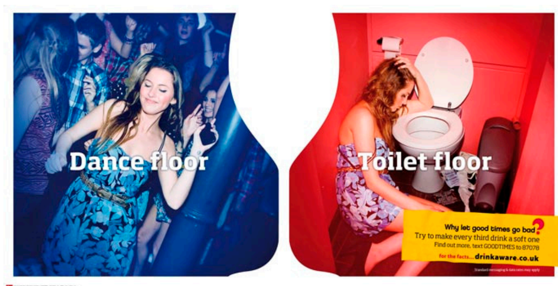
Figure 4. DrinkAware campaign for responsible drinking [125].

such as ‘DrinkAware’ in the UK [121] the ‘Alcohol101’ campaign in the US [122], and various ‘responsible drinking’ campaigns in emerging markets (such as Africa) [123]. Such campaigns are largely ineffective in changing drinking behaviour but are frequently presented as an ‘alternative’ to measures such as compulsory health warnings [90,120,121]. Industry-funded campaigns invariably emphasise individual responsibility in avoiding alcohol-related harm [121]. In addition to being largely ineffective, there is indirect evidence that campaigns focused on ‘binge’ or unsafe drinking may reinforce gendered stereotypes by disproportionately presenting young women as ‘guilty’ of such behaviours (Figure 4) [124].