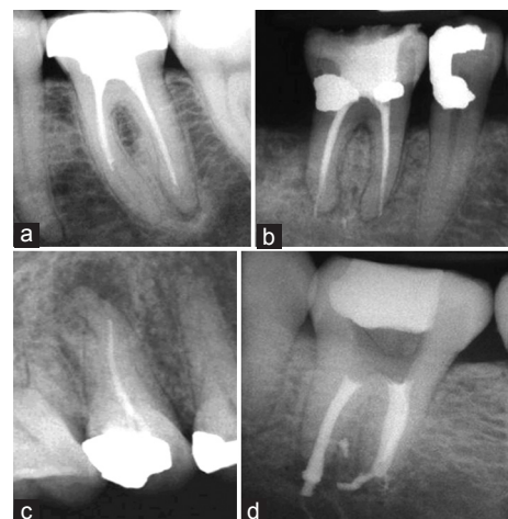
Figure 1: Some kinds of iatrogenic errors in root canal treatment. (a) Ledge (b) Apical perforation (c) Underfilling (d) Overfilling.

In Malaysia in the same year, the results of a 2 years study were reported to introduce void as the most common error in this matter like almost the rest of studies. 16 A rate of 65.5% for void was highlighted by Moradi and Gharechahi in Mashhad, Iran, which was higher in mandible when compared with the maxilla. 17