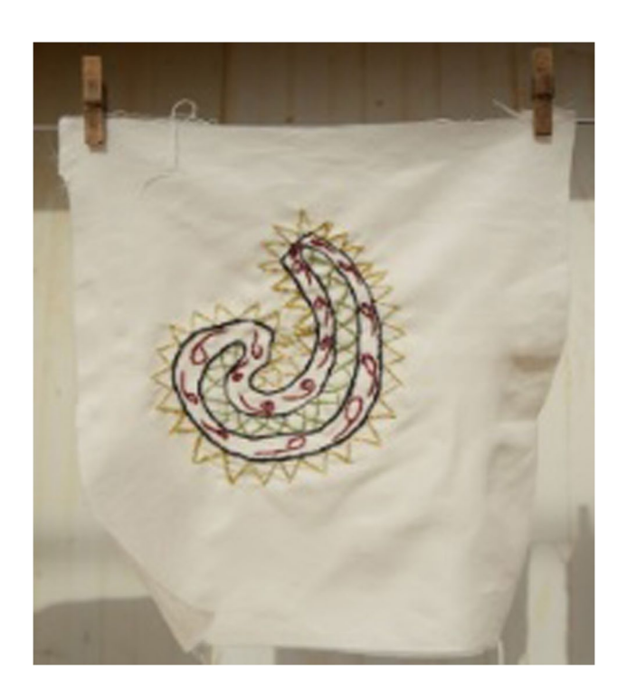
Figure. 5 Syrian Stitch Pilot Sample "My story is about the commas, the paused in between stages of my Syrian life: 1) the time before war, 2) the time of blood, & 3) the time of sunrise, the hope of a new dawn" (Umm Mohammad)

stitch. In addition to design-embroidery materials, each day included an experiential activity, camp artists, and catered lunch. After hours, women chatted in a Whatsapp group; in February 2022 the group has 30+daily posts about embroidery and camp life. Summative evaluation shows women highly valued the Tiraz visit, and want more embroidery training, samples of heritage Syrian textile pieces in camp, high-end embroidery materials, artist collaboration, business training, and access to market opportunities. A panel (Tiraz, Vogue Arabia, UNHCR, Helen Storey, Nabil El-Nayal, myself) blind assessed the women's 60+textile designs, identifying 10 highly creative embroiderers to lead the 2022 project as (1) a Product Group and as Trainers of Trainers (ToTs) to lead an at-large (2) Training Group. Pilot insights included: 1) women are visual/ tactile/experiential learners—countering language barriers and the copying/rote learning techniques of Syrian education; 2) camp artists foster creativity, sketch embroidery designs, and prepare base fabric; 3) women for Product Group/ToTs require business and ToT training; and 4) all participants need culturally-sensitive, digital literacy training to support entrepreneurship. Project goals in 2022 include launching the product and training groups, and working with business consultants to package and market embroidery products for upscale markets (Figures 5, 6, 7, 8).