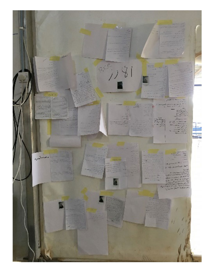
Figure 4. Syrians' Ideas for the book "ZAATARI: Food and Stories from the Syrian People of Zaatari Camp" during a Codesign Workshop

winners. To-date over 2000 Syrians have participated in co-designing the book with recipes, Arab medicine, traditions, stories, poetry, art and photography by people of all ages and ability. Together we are preserving indigenous knowledge, documenting war, life, hope, and resilience. The hallmark success, like my other missions, centers around relationship-building with the Syrian, UNHCR and NGO community—evident from being accepted into people's homes and daily lives, being invited to camp for new missions identified with the community, and being in regular contact with people on social media and messaging tools.