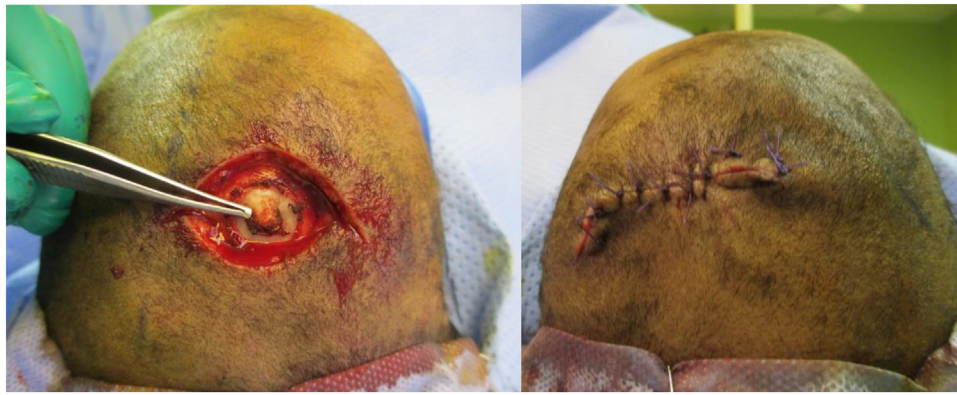
Fig. 3. Intraoperative and postoperative images. (On the left, Intra-operative photo shown the defect and bony spur. On the right, post-operative photo shown the primary closure).