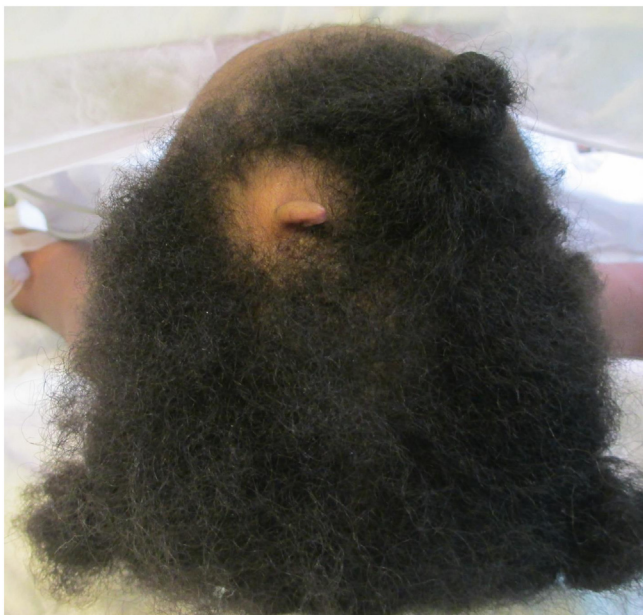
Fig. 1. Clinical picture showing tissue outgrowth and area of alopecia on scalp vertex. (Pre-operative photo shown scalp skin tag).