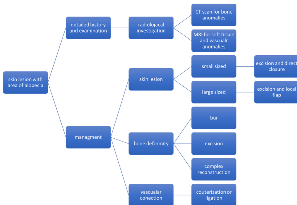
Fig. 5. a proposed algorithm for the management.